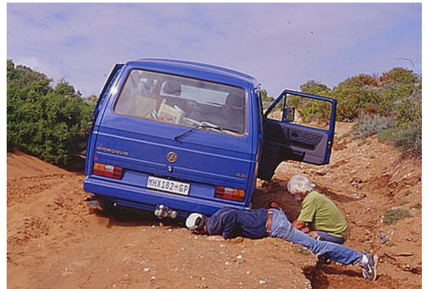
If you're going to be stuck, it might as well be in South Africa