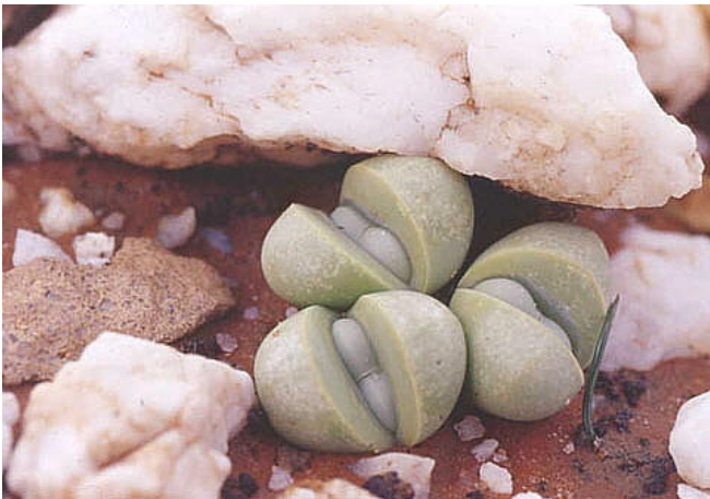
Agyroderma in habitat

[both books, "Mesembs of the World" and "Guide to the Aloes of South Africa" are in the club library. Check it out! - ed.]