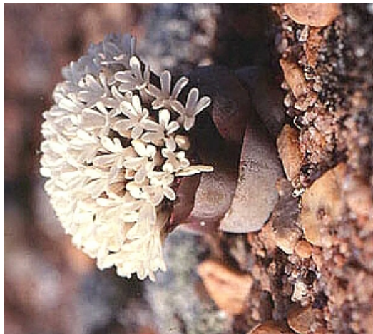
Crassula columnaris in habitat