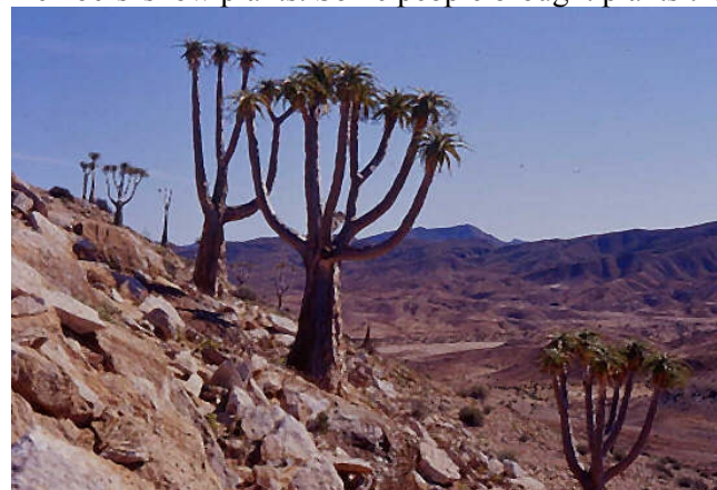
Aloe pillansii

After the program, we had our usual period of mingling and eating. Then, of course, we moved to the Plants of the month which featured many members' show plants. Some people brought plants that were already lovely,